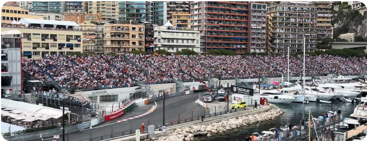
View from grandstand...

In addition, there is a large TV screen so you won't miss any of the race action.