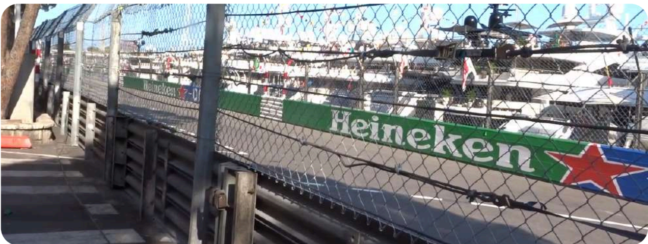
View from general admission area Z

Grandstand T is a very nice grandstand. From here, you have a view of the pit lane and the pit garages. In Monaco, overtaking is difficult, so positions are often gained during pit stops, which you can watch very well from this grandstand. If you are seated on the right side of the grandstand, you can see the cars coming out of Turn 15 and heading towards Turn 16. On the left side, you can see the cars driving towards Turn 18. The upper section of Grandstand T is covered.