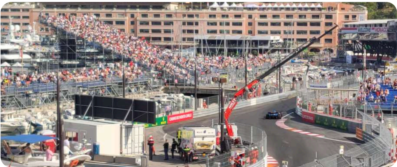
View from grandstand K

Grandstand K is a large and popular harbor grandstand. Here, you get a great view from the exit of the Nouvelle Chicane and the Tabac corner, all the way to the entrance of the swimming pool complex. Seats in the highest row of K also offer a view behind the grandstand, where you can see the pit lane, start/finish, and Turn 1 (Sainte Devote).