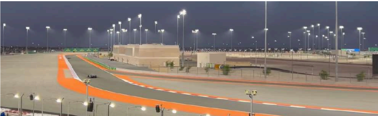
View from the T3 Grandstand

The Main Grandstand at Lusail GP circuit is located directly on the Main Straight. You will see the main straight, the pit lane and the F1 team garages. Ticket holders will have a view of the starting line, grid ceremony, pit-stops. You might even see the winners podium ceremony and trophy presentation after the race. However, this depends on your exact location on the grandstand.