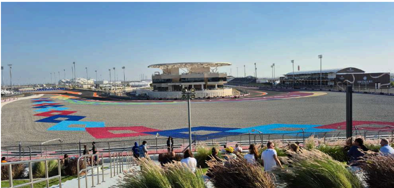
View from Turn 1 General Admission

Just before entering the straight, the drivers have one final corner to take. Will they attempt an overtaking move here, or will they wait until Turn 1? A daring move at this point could result in losing the gained position in Turn 1. Seats are unassigned, allowing you to choose the best spot in the grandstand yourself.