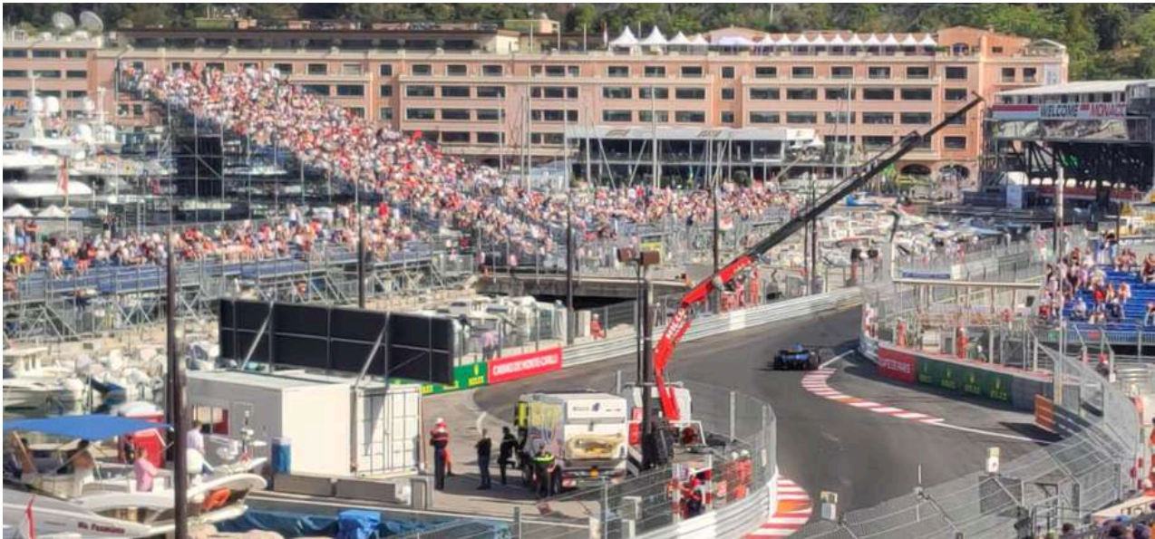
View from Grandstand K

Grandstand A is on the inside of Sainte Devote (Turn 1). From here, you have a magnificent view of Turn 1. This is the action zone on the Monaco circuit, making it one of the premier grandstands at Monte Carlo. However, it is one of the more expensive grandstands on the circuit.