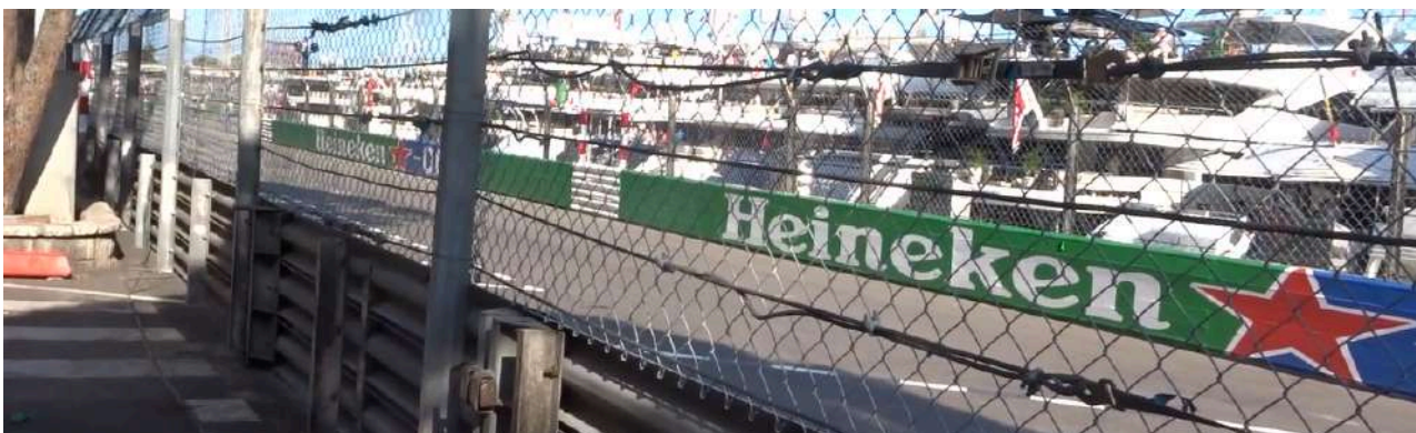
View from Z

This is why they are more budget-friendly. X2 is the better choice in this area as it's closer to the start/finish line. Note that these stands don't have a view of a large TV screen.