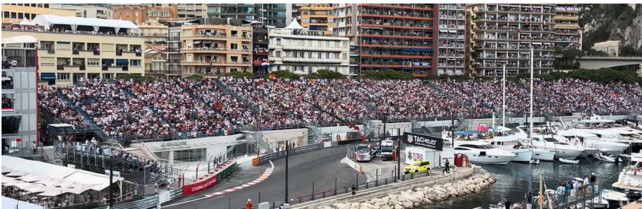
View from Grandstand O

Grandstand M is located at Turn 13 and Turn 14. This grandstand has a breathtaking view of two of the swiftest corners on the Monaco circuit. It offers spectators an exhilarating experience.