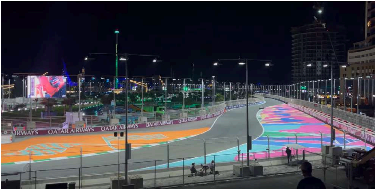
View from Central Grandstand D

Grandstand D is located at turns 9 and 10, this grandstand offers a great view of these corners. However, you will also be able to see the racing actions at turns 10, 16, 17, and 18.