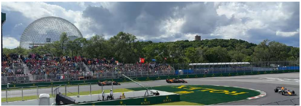
View from Grandstand 24

A popular choice! This grandstand at turns 8 and 9 provides exciting action throughout the weekend. In 2023, it was the location of an incident involving George Russell, adding to the drama. You'll also have a great view of cars approaching from turn 7.