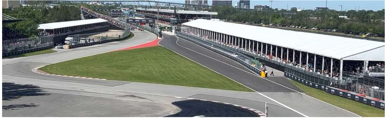
View from Grandstand 11

Grandstand 16 is also located on the straight next to Grandstand 1. It offers a good view of the last turn, known as 'the wall of champions,' it also provides a clear view of the pit lane, just like Grandstand 1.