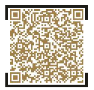
Canadian Grand Prix Tickets