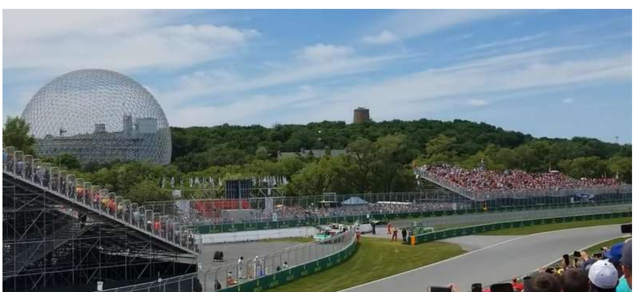
View from Grandstand 46

If you're looking for Grandstands which are a little more budget friendly, then Grandstands 46 & 47 might be an option for you. They are located in between corner 11 and 12 after the haripin and just before the second DRS activation zone. Keep in mind though, that these grandstands do not offer views of tv screens. However, because they are only slightly more expensive than general admission, they are still a good option.