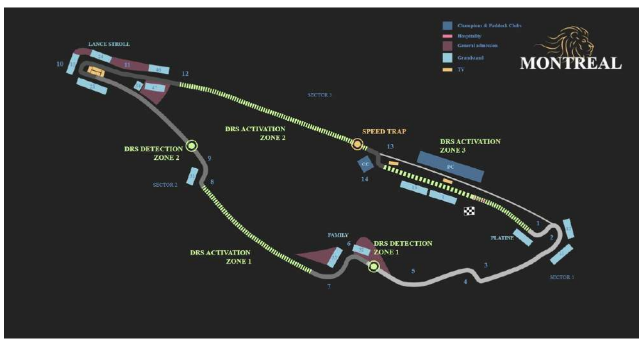
Circuit Gilles Villeneuve, Canada

Below you will be able to find an overview of the different types of tickets which are available at the Circuit Gilles Villeneuve in Canada. Along with this you can find information on the views that the different tickets offer and if it is worth the price you pay for it.