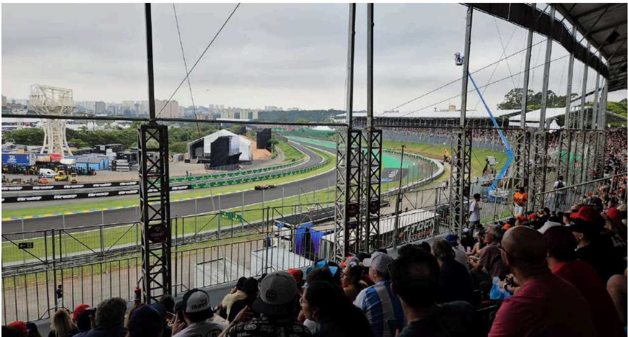
View from Grandstand H

Grandstand N lies on the inside of turn 3 between grandstands H and R. It offers a nice view. It does provide less coverage than grandstand H. But it is still better than grandstand R. This grandstand is an exceptional choice for its price. And we strongly recommend it!