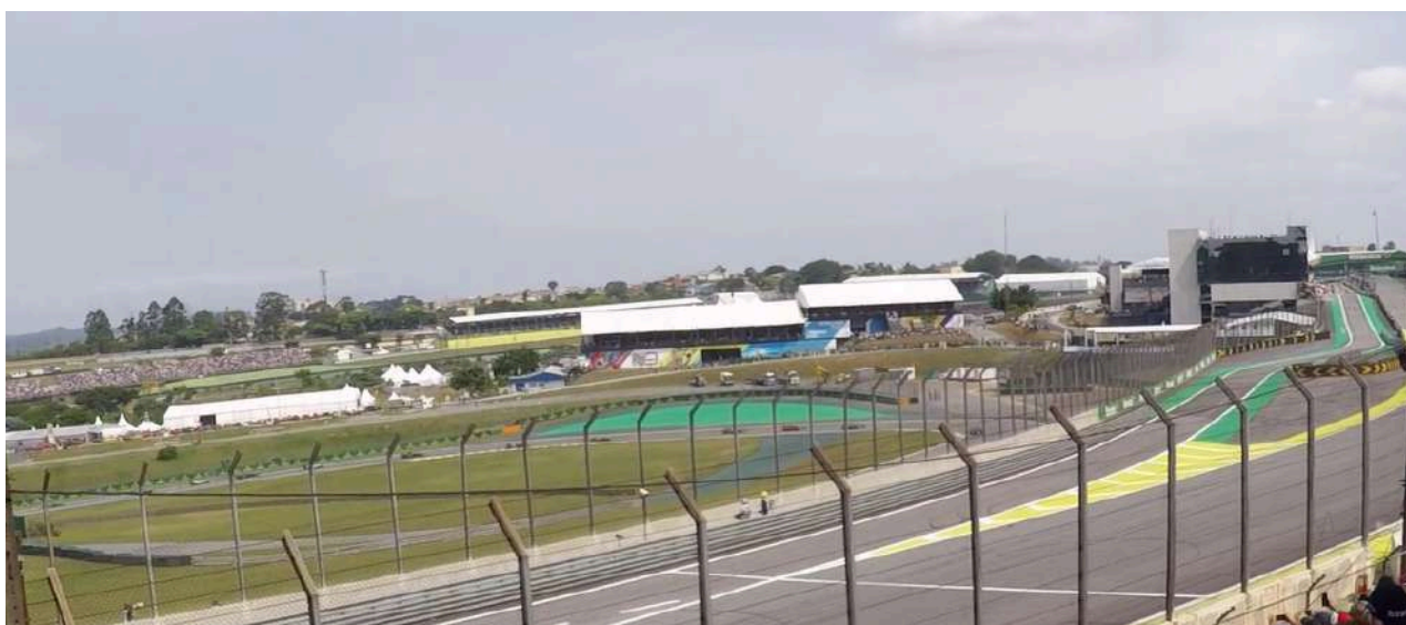
View from Grandstand A

The most budget friendly grandstand option is Grandstand G (still labeled as Grandstand Q on the map) therefore, it is a suitable choice for those on a relatively modest budget. The grandstand overlooks the straight between turns 3 and 4. It offers a prime vantage point for witnessing numerous overtakes. It's fantastic to immerse yourself in the enthusiastic atmosphere of Brazilian fans.