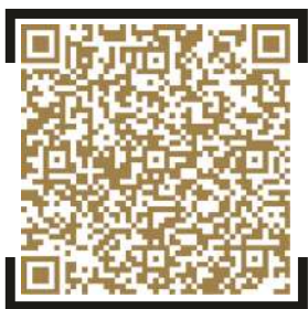
Brazilian Grand Prix Tickets