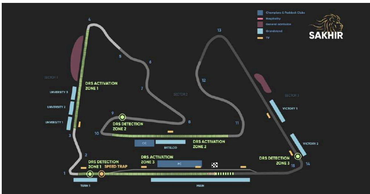
Circuit Layout Bahrain Circuit

Below you will be able to find an overview of the different types of tickets which are available at the Bahrain Grand Prix. Along with this you can find information on the views that the different tickets offer and if it is worth the price you pay for it.