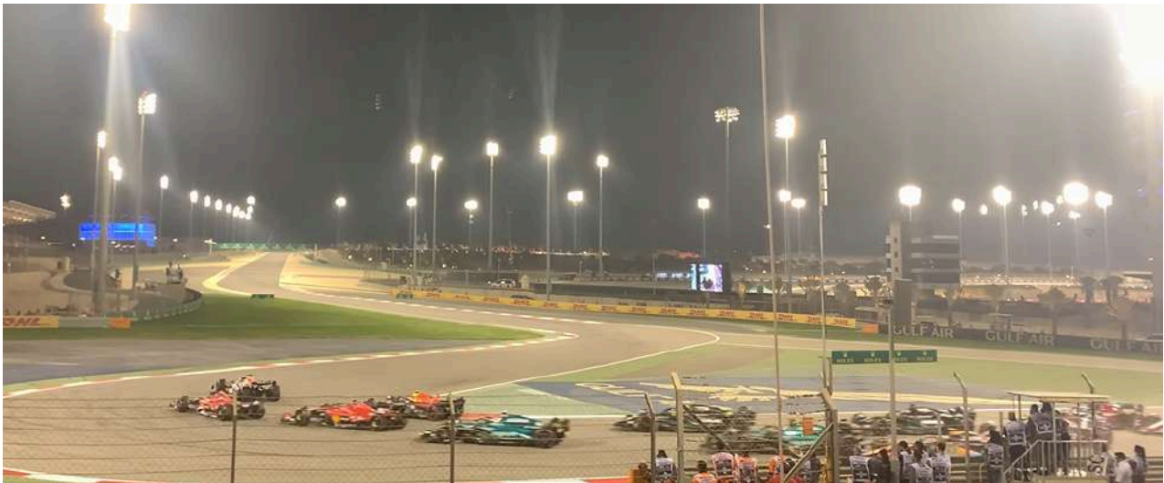
View from Turn 1 Grandstand

As on most circuits, tickets in the Main Grandstand are the most expensive in Sakhir. The spots are located opposite the pit boxes. This is a great place to witness for pit action, pre-race build-up, the start, and finish. But you won't get much of an overtake or other on-track action. The main Grandstand is covered, which does provide extra comfort.