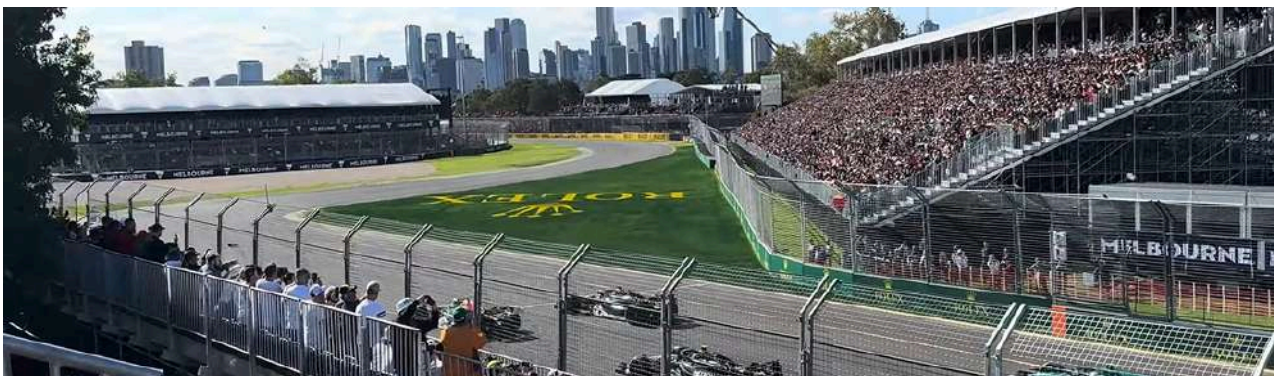
View from the Moss Grandstand

Compared with Fangio, the Moss Grandstand is slightly further down the main straight. The Moss Grandstand provides a splendid vantage point of Turn 1. This is a key overtaking spot at the Melbourne circuit. Witness the excitement of the race start as cars maneuver through the initial corner. This grandstand is not the highest in price and offers excellent value for money.