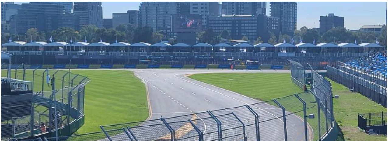
View from the Prost Grandstand

The Schumacher Grandstand is located at Turns 14 and 15. These are the final corners of the Australian Circuit. This grandstand offers a prime position opposite the pit lane entrance. Known for its excellent value for money, this grandstand stands out. It is one of the top choices available at the Melbourne circuit.