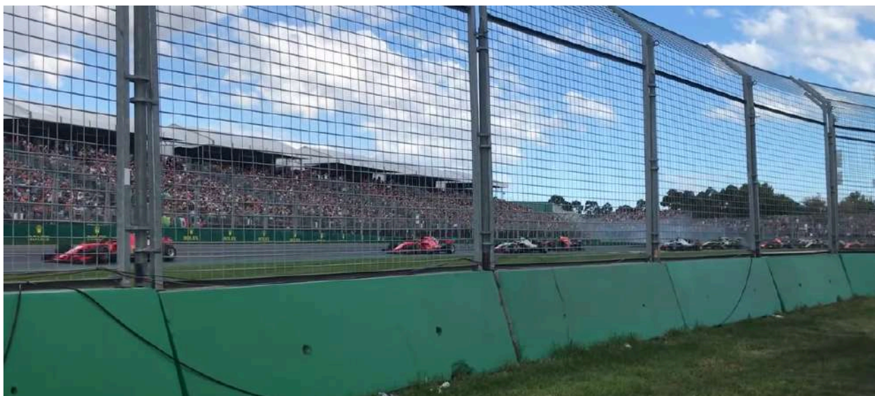
View from General Admission turn 1 / 2

Across from the Prost Grandstand, this grandstand gives you a superb view of the pit lane. It allows you to follow live race strategies. Situated at the latter part of turn 16, it also offers a clear sight line of the main straight. Although one of the more expensive options at the Melbourne circuit, the Prost Grandstand presents a superior alternative.