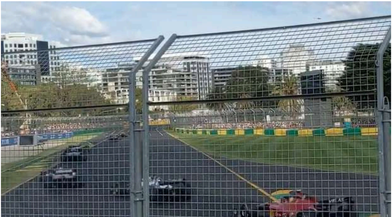
View from the Waite Grandstand

The Vettel Grandstand is located at the end of the fourth DRS activation zone just before turn 11. The cars will be coming past you very quickly before they will have to brake heavily to turn into the 11th corner on the Albert Park circuit.