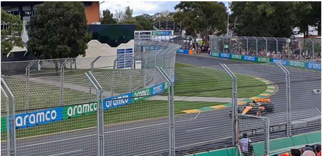
View from the Stewart Grandstand

Nestled at Turn 8, the Button Grandstand would offer you a view of Turns 6, 7, and 8. You will witness cars going past swiftly from Turn 8. This grandstand is one of the more affordable choices at the Australian circuit. It provides an excellent view without breaking the bank.