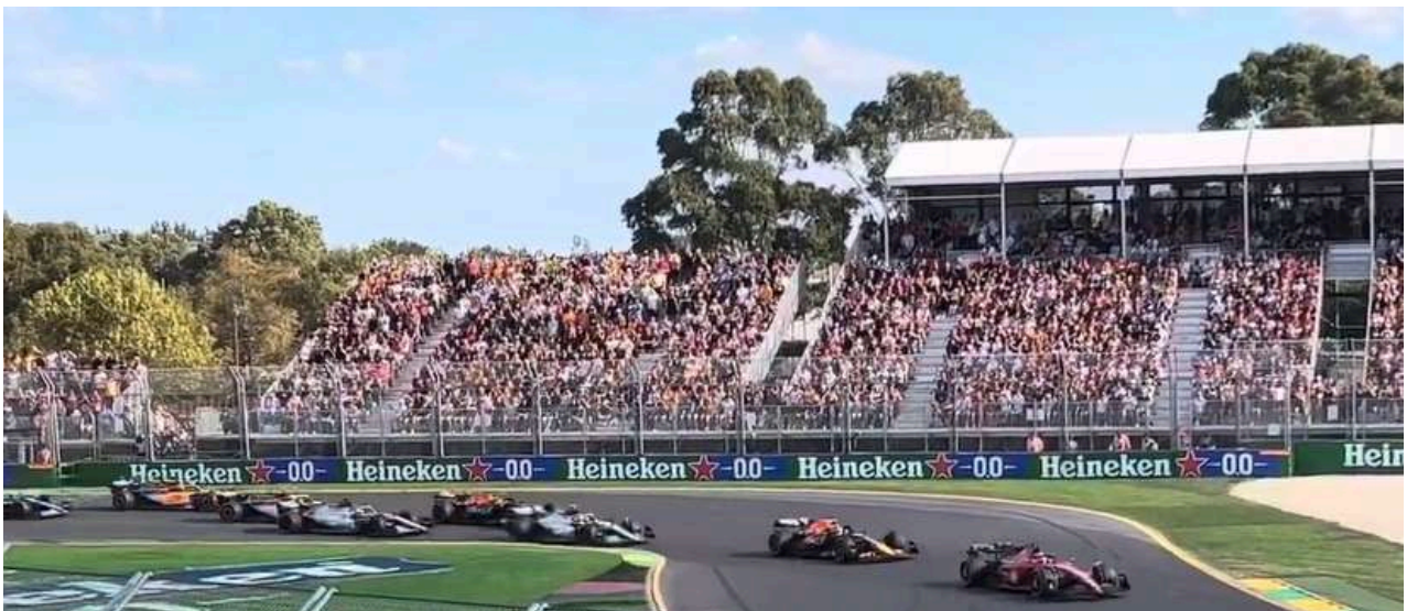
View from the Brabham Grandstand

The Hill Grandstand is positioned at Turn 3, following the second straight. It offers prime viewing of a hotspot for overtaking maneuvers. Enjoy a great perspective of turn 3 from this grandstand! It falls somewhere in the middle range in terms of pricing. So it is neither the most extravagant nor the most budget-friendly.