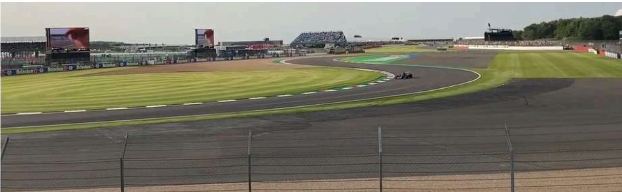
View from the Chapel Grandstand

The Vale grandstand is located at turn 16. It offers a fantastic view of corners 16, 17, and 18. It also provides a clear sight of the pit lane entrance to follow live race strategies. It's one of the cheaper grandstands at the Silverstone circuit.