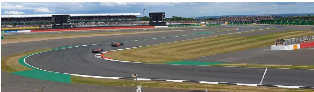
View from Village A Grandstand

The pricier and covered Village 1/2 grandstands provide a great and close-up view of the F1 cars. Here you will see drivers tackling the challenging and slow Village and Loop corners. Additionally, it's a short walk to the Village podium. Here are concerts during the Grand Prix weekend. The cheaper Village A is also an excellent choice, offering views of a large TV screen.