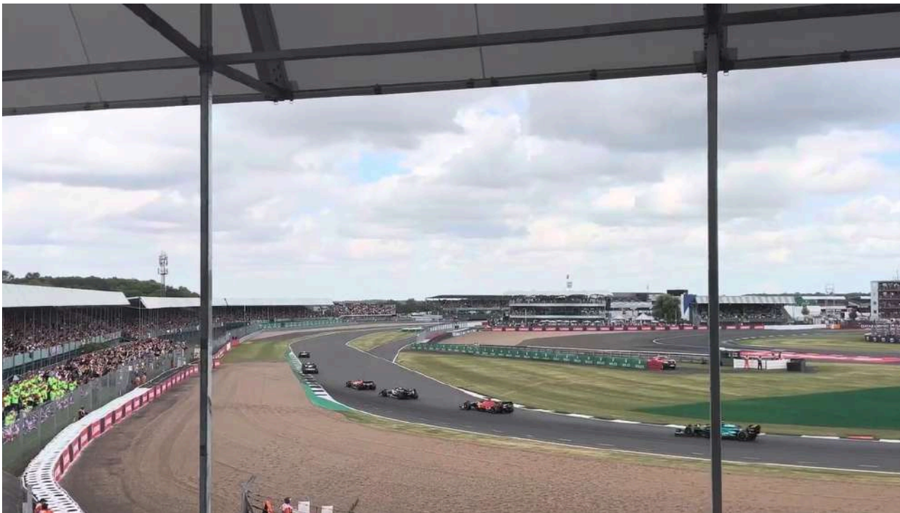
View from Luffield Grandstand

Woodcote, located at turn 8, offers views of turns 6 and 7 due to its relatively high position. These turns follow Hangar Straight, the first DRS zone at the Silverstone circuit. It's one of the cheaper grandstands at the British circuit.