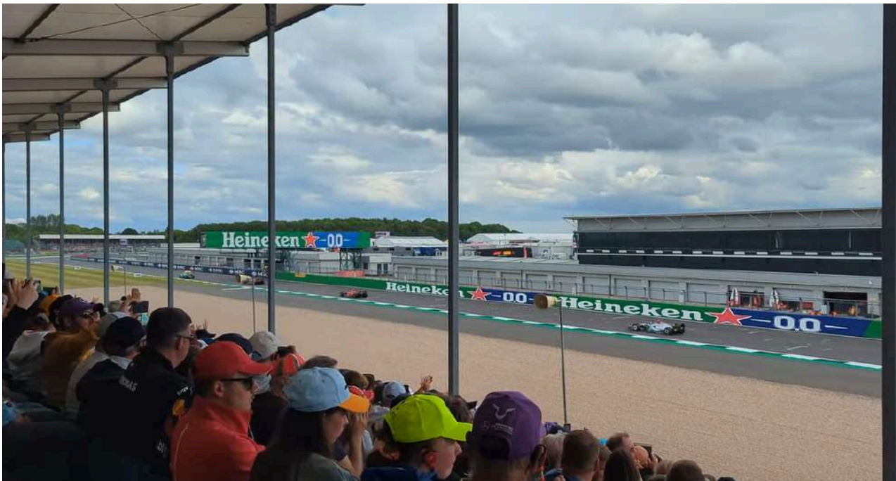
View from the National Pit Straight Grandstand

From the two, Stirling B will have a better view of Copse corner. You will be able to see the cars coming from Woodcote into the high speed corner Copse.