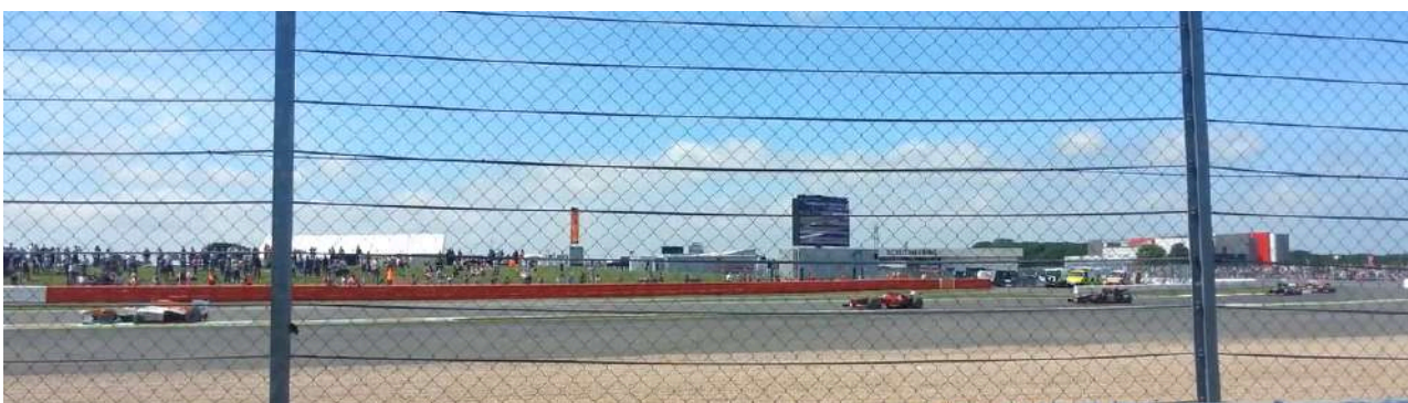
View from General Admission, Copse Corner

It's crucial to secure your preferred spot as early as possible. On Saturday and Sunday popular areas, especially Vale, fill up quickly.