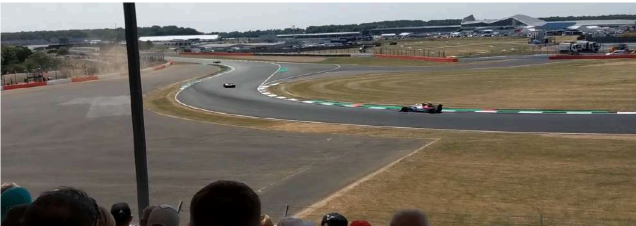
View from the Becketts Grandstand

Hamilton B is not covered. Due to the Red Bull hospitality your sight on the last few corners would be limited. The grandstand is located right on the start / finish line which gives you a great view of the start of the race and turn 1. Besides this, you will also get a great view of the pitboxes of the top teams.