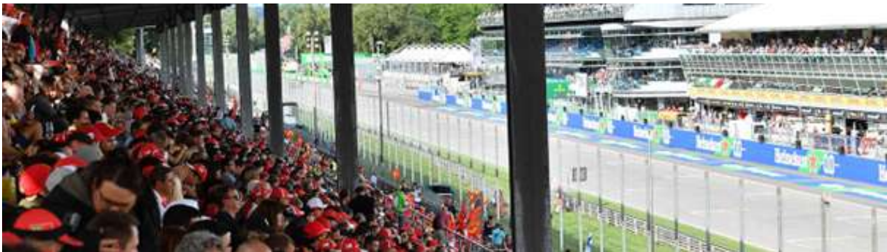
View from Grandstand 26C

Are you a cost-conscious racing fan? Please consider stands without reserved seat numbers (free seats).