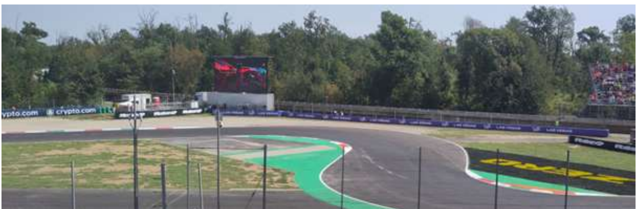
View from Grandstand 8B

On the outside of the circuit, a large grandstand has two sections. Esterna Prima Variante A (Grandstand 8A) and Esterna Prima Variante B (Grandstand 8B). 8A grandstand offers a superior track view compared to grandstand 8B. However, it does also come at a higher cost.