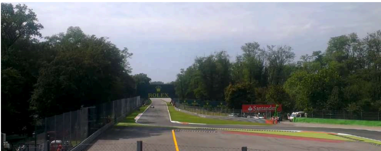
View from Roggia (Grandstand 10)

Grandstand 11 is located on the second DRS straight. However, it does not give you the best view as you will have a limited view of the corners.