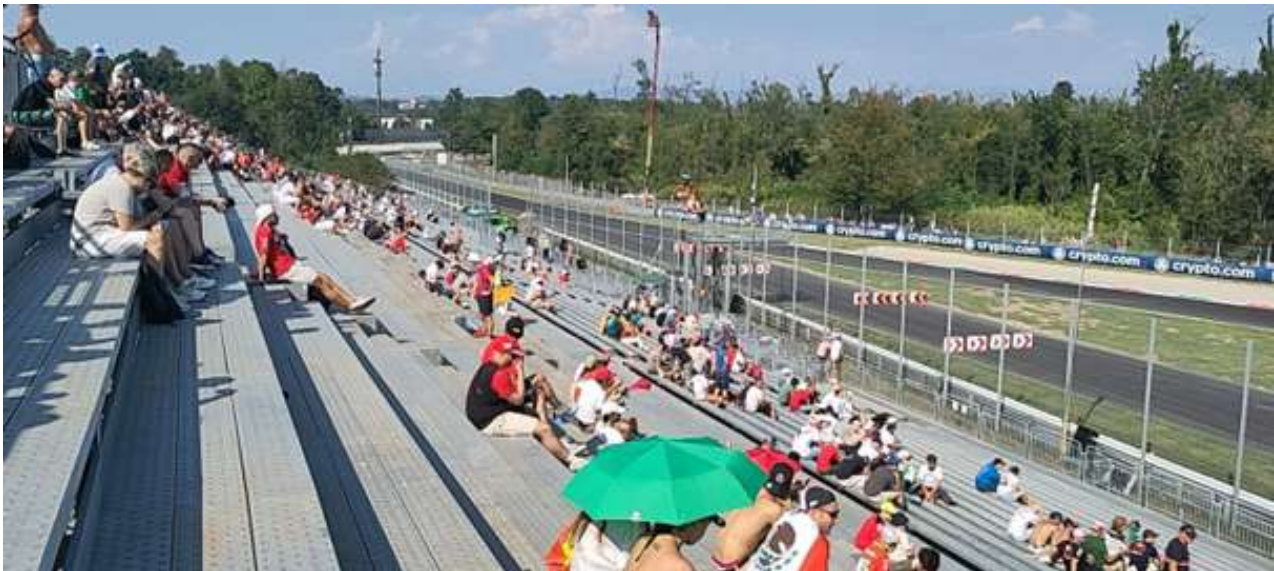
View from Grandstand 8A

Midway between the start-finish and turn 1 is Piscina (Grandstand 5). Honestly, this is a less recommended and budget-friendly option. At the opposite end of the same straight, closer to the Parabolica exit, is the covered Vedano (Grandstand 24). This grandstand is a better choice for a slightly higher cost.