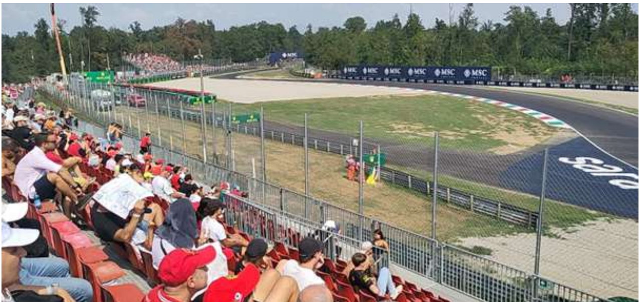
View from Ascari 16 Grandstand

The outer Ascari stands (Stands 18, 19, and 20) are on the straight between Variante Ascari and Curva Parabolica. Uscita Ascari B (grandstand 19) and Uscita Ascari C (grandstand 20) are small covered stands. In conclusion, there are better views available for the same price.