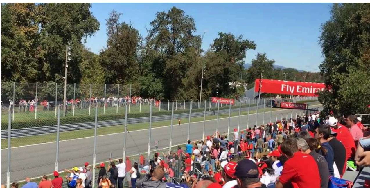
View from Laterale Parabolica (21E)

✔ Two additional grandstands are inside the circuit at the exit of the Parabolica corner. This is near the entrance to the pit lane. The two grandstands are pretty similar. Hence, the more affordable Parabolica Interna A (grandstand 23A) is a superior choice to Parabolica Interna B (grandstand 23B).