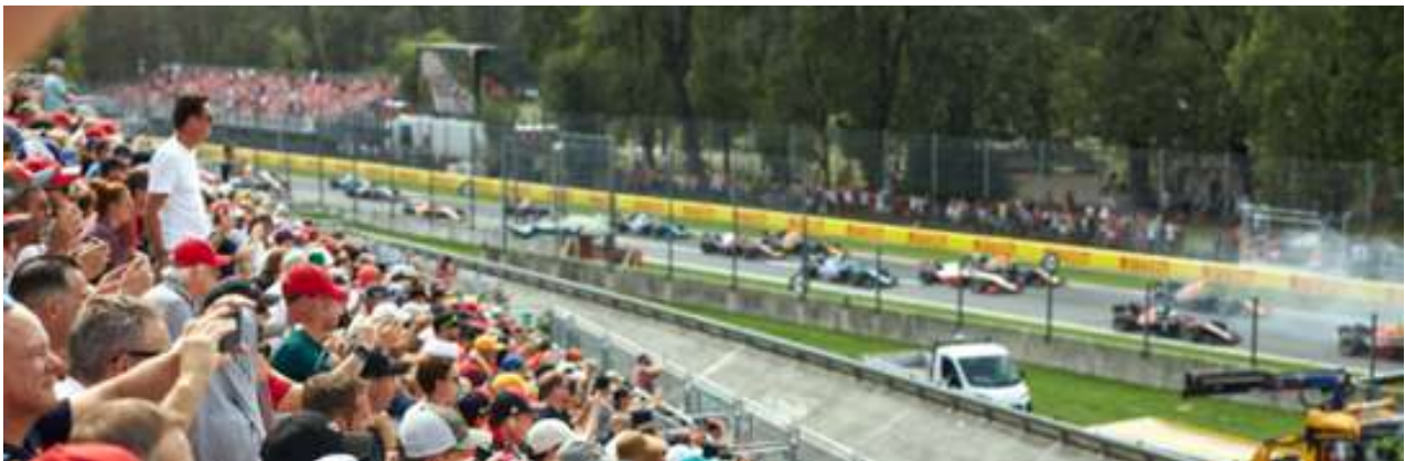
View from Grandstand 6B

Alta Velocita B (Tribune 6B) and Alta Velocita A (Grandstand 6A) are farther from the bend. However, they still provide good views. Because of the location, these grandstands are more budget friendly.