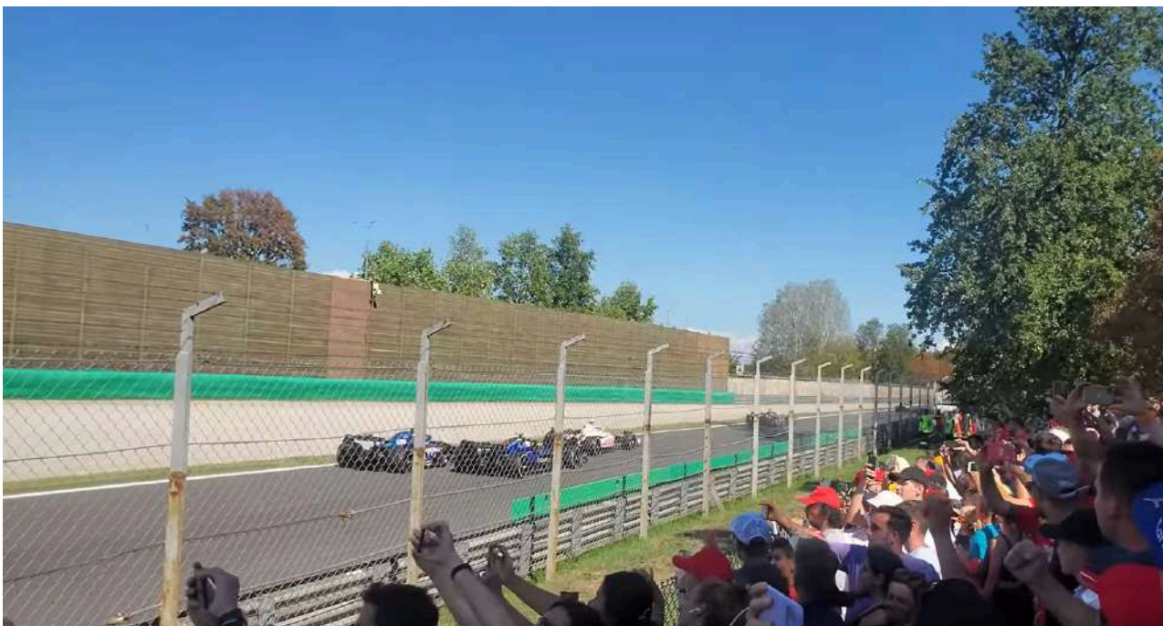
View from General Admission Curva Grande

Within the general admission areas, there are numerous small bleachers and raised viewing spots. A complete F1 experience at Monza involves a stroll through the forest to the farthest section of the circuit. Here, you can enjoy the view from the Curve di Lesmo (turns 4 and 5). Additionally, the general entrance area on the inside of Curva Parabolica is a noteworthy viewing recommendation.