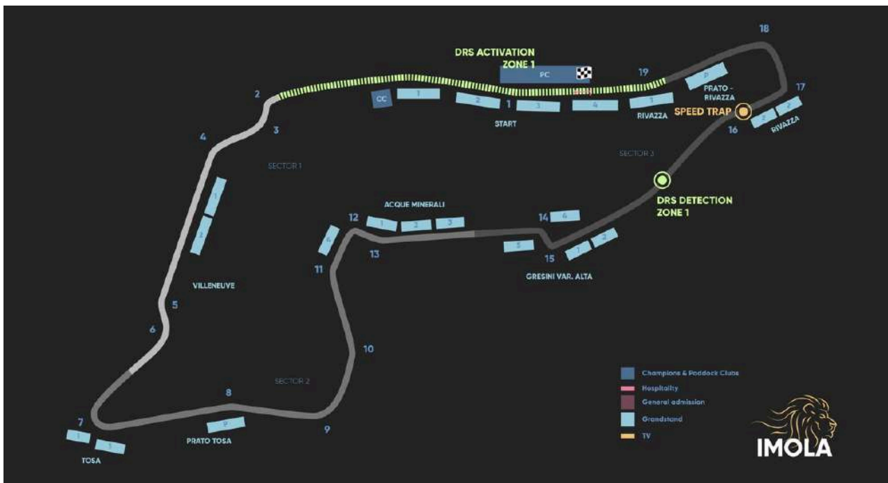
Circuit layout imola

There are different grandstands per category for example Acque Minerali 1 t/m 4. The views for these grandstands can differ slightly, however, in this guide, a general description of the grandstands will be given.