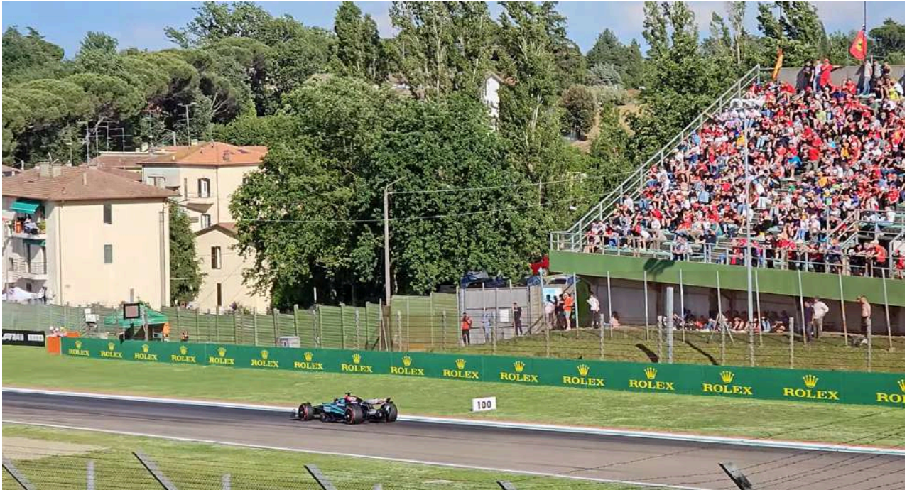
View from Rivazza 1 Grandstand

Grandstand Rivazza 2 offers a view of three corners (16, 17, and 18). This grandstand has a focus on the dynamic action zone of corners 17 and 18. This was where Valtteri Bottas made a crucial mistake in 2020, under pressure from Max Verstappen.