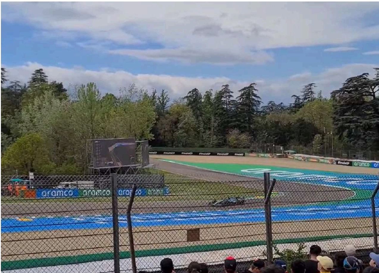
View from General Admission, Acque Minerali

Some good places to watch the racing action from are at the start of turns 12 and 13, and at turns 2,3, and 4.