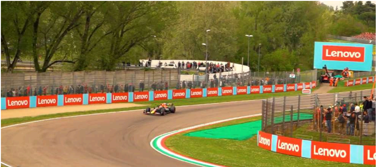
View from Tribuna Tosa 1

Choosing the Villeneuve Grandstand gives you a view of cars coming out of turn 3. You can see them speed up before they brake for the quick turns 5 and 6. Notably, this is where Max Verstappen experienced a tyre blowout in the 2020 race.