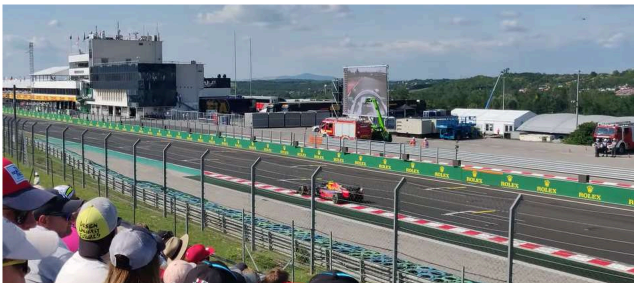
View from the Grand Prix 1 Grandstand

Situated along the extended bend of turn 14, Apex 1 offers views of cars entering and exiting bend 14. With a good view of the final turn, it is a real favorite among fans. The Apex 1 Grandstand has a large TV screen so you won't miss any of the racing action. The Apex 1 Grandstand was previously the Silver 3 Grandstand.