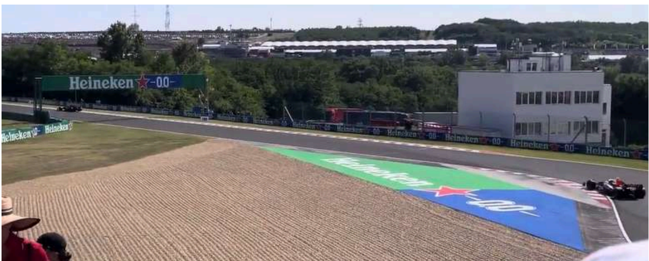
View from Chicane 1 Grandstand

Above the Chicane 1 and Chicane 2 grandstands is the Chicane 3 grandstand. From here, you have more visibility of the Hungaroring circuit because you are seated higher up.