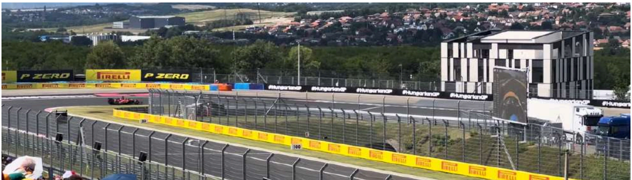
View from the Pit Exit Grandstand

Additionally, this grandstand features a large TV screen, so you won't miss any of the race action at the Hungaroring.