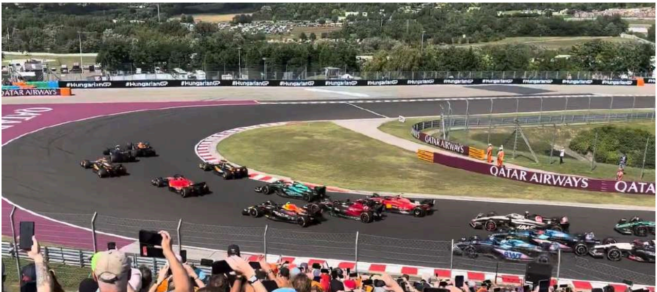
View from the Turn 1 Grandstand

There is a large TV screen at this grandstand so you won't miss any of the race action.