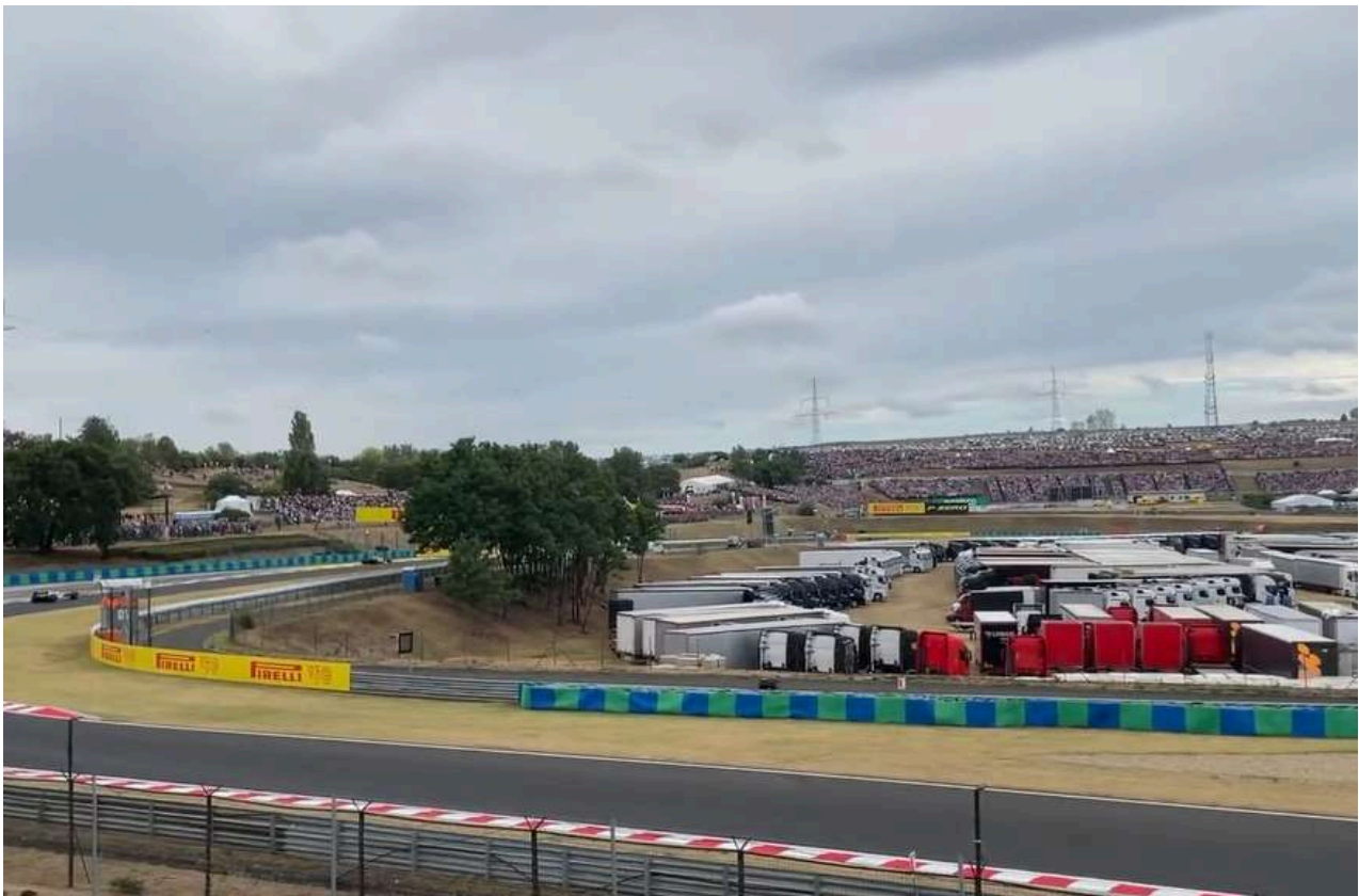
General Admission view from Turn 12

These are some of the most affordable and beautiful General Admission tickets on the F1 calendar!