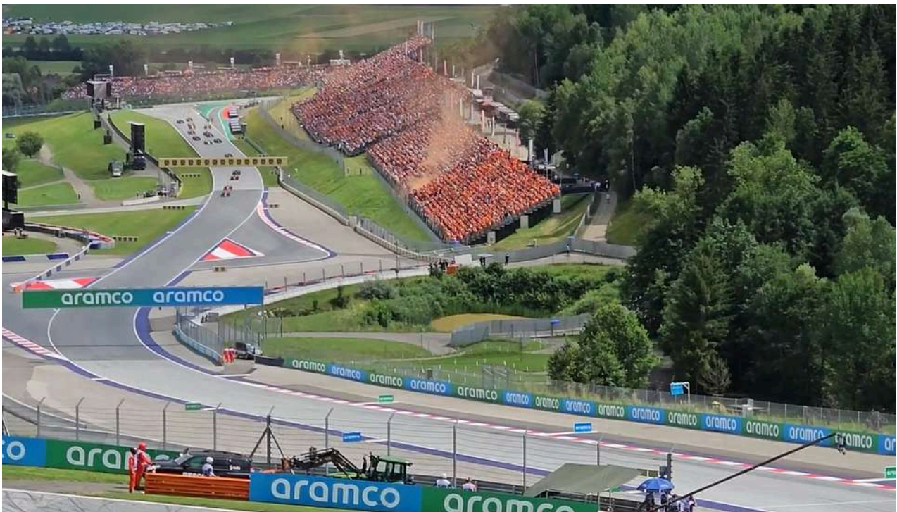
View from Turn 3 Grandstand

Equipped with a TV screen, you will not miss any of the race's thrilling moments. These tickets deliver excellent value, despite not being the priciest choice. This is due to the impressive panoramic views at a well-known location to overtake.