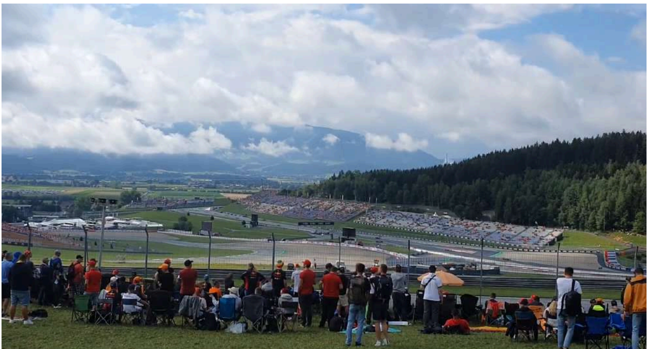
General Admission view from around Turn 6

The circuit offers plenty of space for all general admission areas. This is due to the immensely large hilly terrain around the track. Considering the low prices for general admission places, this is one of the best races to attend. Especially since it is the home race of Max Verstappen's racing team.