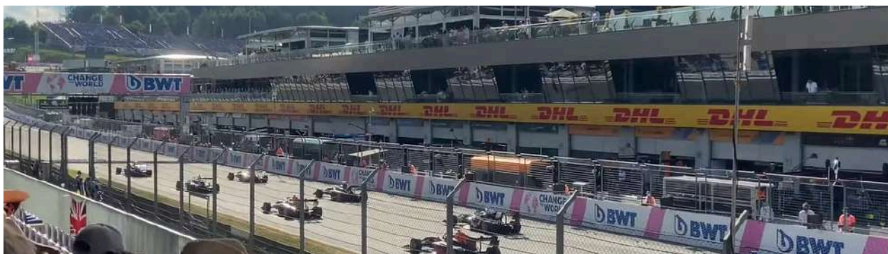
View from Main Grandstand Section G