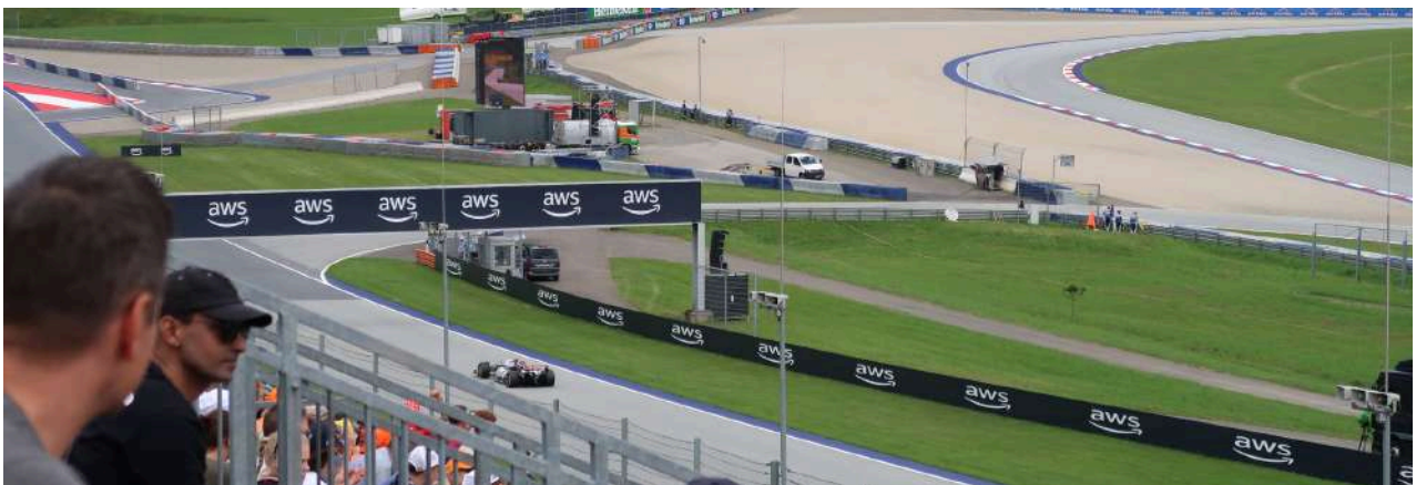
View from Red Bull D

Tickets then get cheaper to section K, which is quite far from turn 1 towards turn 2. The grandstand goes on to section P. It has limited viewing angles and panoramic views. From the middle sections FGHI, you will have good views of the inner circuit turns 4-5.