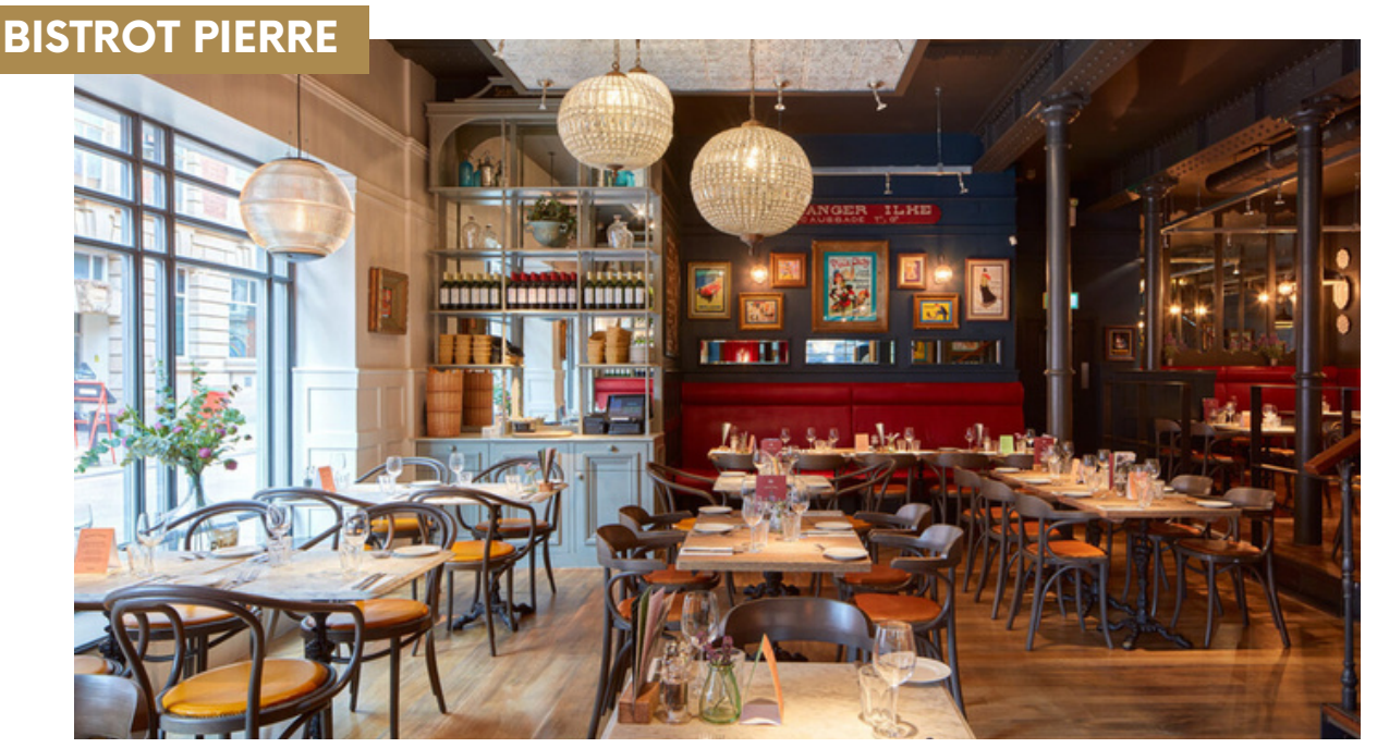
French | €€-€€€ | Lunch, Dinner

Bistrot Pierre is a French bistro a ten-minute walk from the Novotel. Try the famous duck breast salad, the marinated mussels or the boeuf bouguignon. Or just a steak or burger if you're not a fan of French cuisine. The restaurant is located in a quiet, characterful environment.